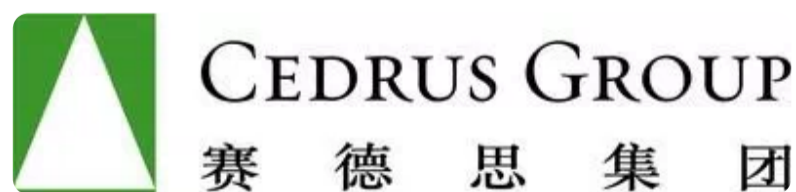
Cedrus Group Logo

HONG KONG, March 22, 2021 /PRNewswire/ -- Cedrus Group ("Cedrus") , a global financial services and investment group, is pleased to announce that it will be opening a new regional head office in Zurich, Switzerland . The new office will further enhance the group's presence in Europe and better serve its European client base with more investment opportunities especially in life sciences and key technology sectors, including innovative technologies , as well as facilitating the communications between Chinese and European investors and companies alike. Moreover, the new office will further enhance Sino-Swiss economic and business relations in conjunction with the China-EU Comprehensive Agreement on Investment, which offers significant growth in opportunities for cross-border M&A and investment activities .